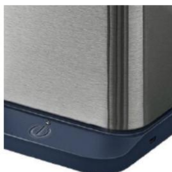
Touch-on Button Press button to sterilize cyclically easily

Model:BS2022 Outer barrel material: 304 stainless steel Inner barrel material:PP Functional: disinfect,Storage rack Usage Space:Kitchen Size:110*130*245mm